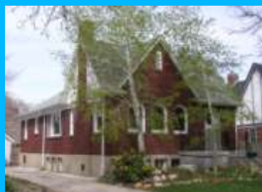
1032 S 1700 EAST A