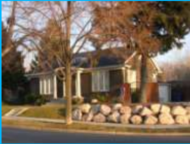
947 S 1500 EAST A