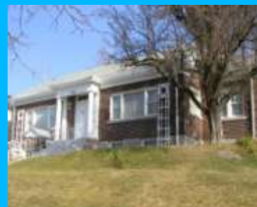
983 S 1300 EAST A