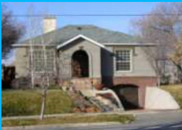
976 S 1500 EAST C?