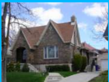
1009 S 1400 EAST A