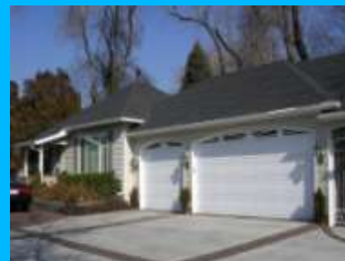
921 S 1300 EAST C