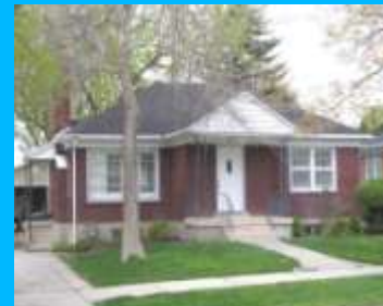
1114 S 1900 EAST A