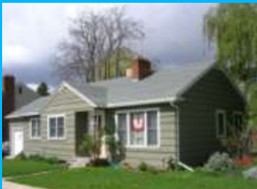
916 S 1900 EAST A