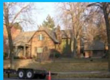
1097 S 1500 EAST B