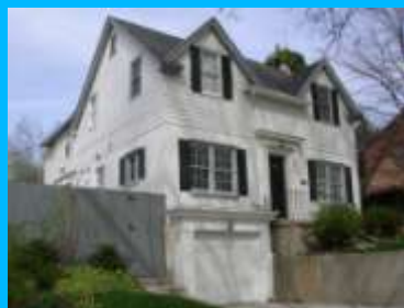
990 S 1700 EAST A