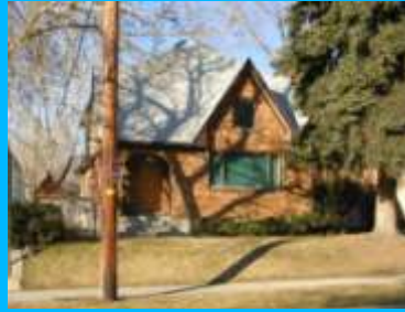
1595 E 1300 SOUTH B