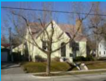
1725 E 1300 SOUTH B