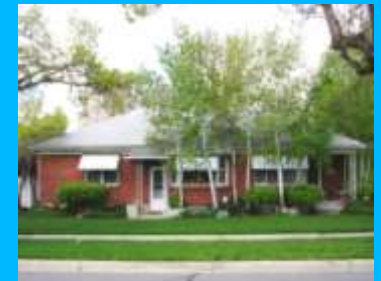
1142 S 1900 EAST B