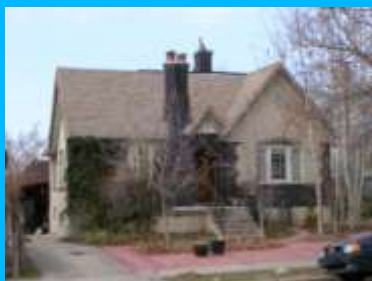
1194 S 1500 EAST B