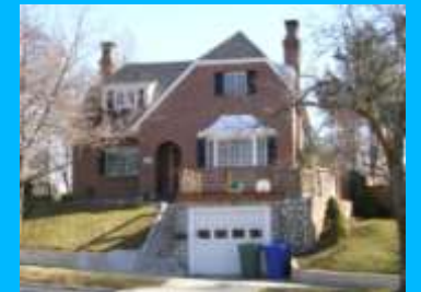
1408 E 900 SOUTH A