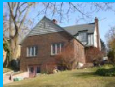
1221 S 1300 EAST A