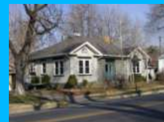
928 S 1500 EAST C