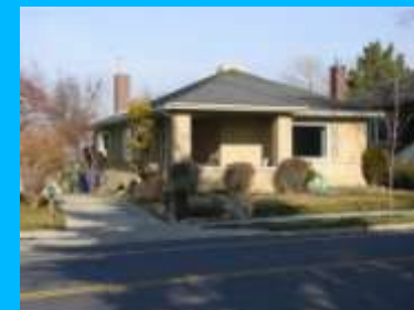
946 S 1500 EAST C