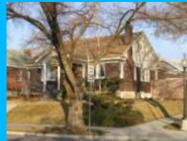
1187 S 1500 EAST B