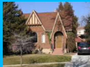
1429 E 1300 SOUTH A