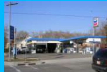
1709 E 1300 SOUTH D