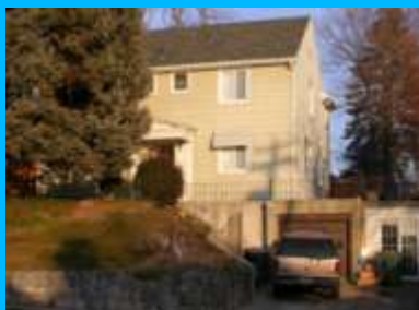
1013 S 1500 EAST B