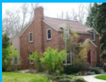
967 S 1700 EAST A