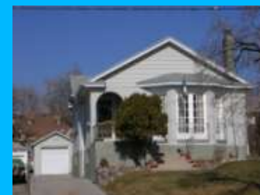
1475 E 1300 SOUTH B