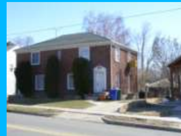
1336 E 900 SOUTH A