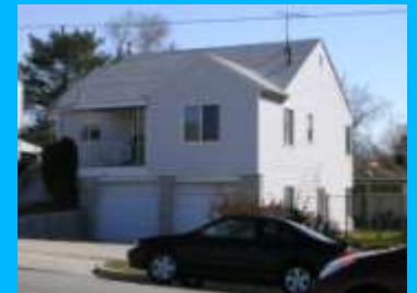
1344 E 900 SOUTH B