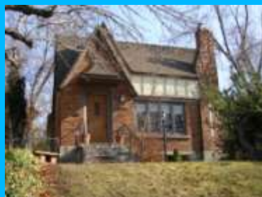
1193 S 1300 EAST A