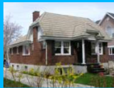
1064 S 1700 EAST B