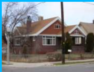
1200 S 1500 EAST B