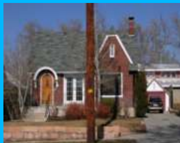
1355 E 1300 SOUTH A