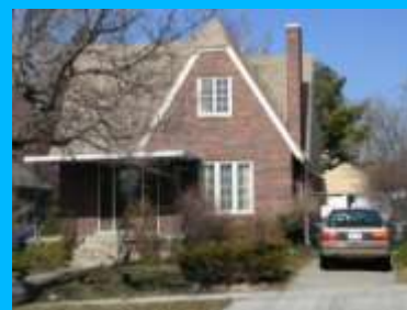
1339 E 1300 SOUTH B