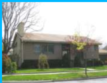
1191 S 1700 EAST D