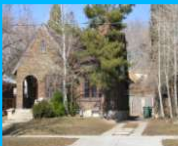
1391 E 1300 SOUTH A