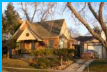
919 S 1500 EAST A