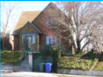
1412 E 900 SOUTH B