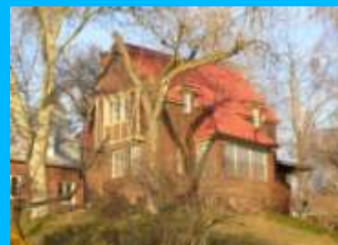
1035 S 1500 EAST A