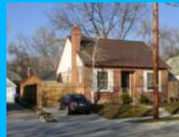
1747 E 1300 SOUTH B