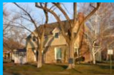
923 S 1500 EAST B