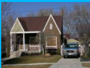
1371 E 1300 SOUTH B