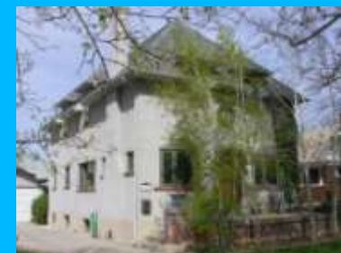
1068 S 1700 EAST A