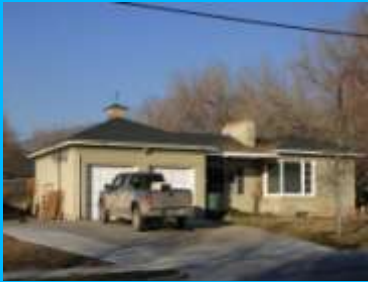
1817 E 1300 SOUTH D