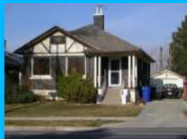
938 S 1500 EAST A