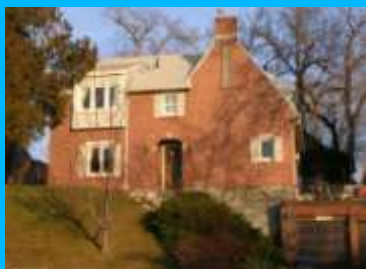
1023 S 1500 EAST B