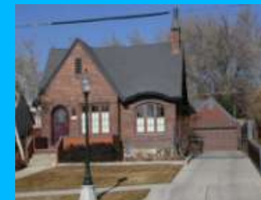
1365 E 1300 SOUTH A