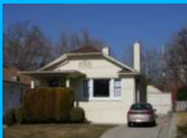
1417 E 1300 SOUTH A