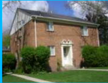
852 S 1900 EAST B