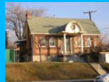
1207 S 1500 EAST A