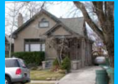
1180 S 1500 EAST B