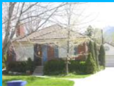
1109 S 1800 EAST B