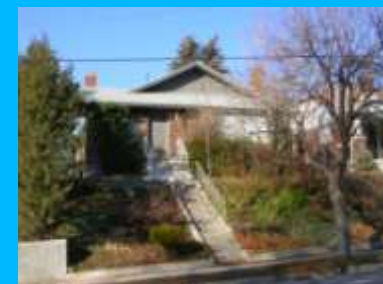
1020 S 1500 EAST C