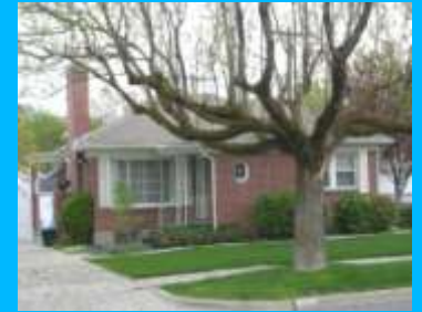
1222 S 1900 EAST A