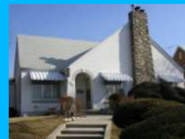
967 S 1300 EAST B