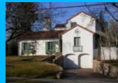
1100 S 1500 EAST A