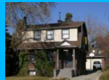
1433 E 1300 SOUTH B