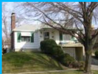
861 S 1400 EAST B