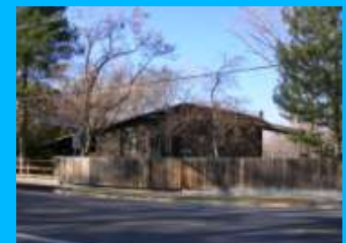
1062 S 1500 EAST D