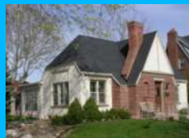
1148 S 1700 EAST A