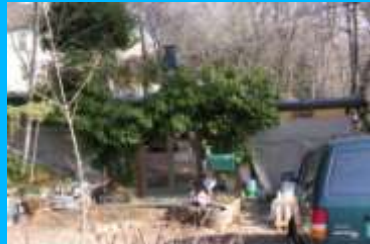
1081 S 1300 EAST D