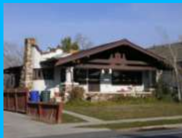
936 S 1500 EAST A