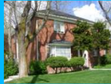
860 S 1900 EAST A