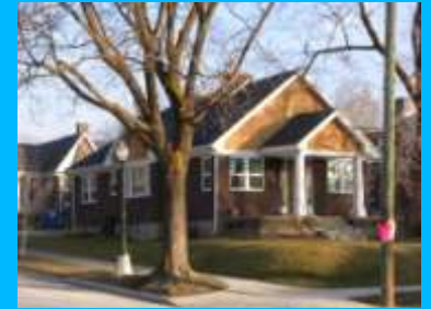
1165 S 1500 EAST B