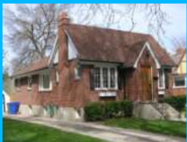
1052 S 1700 EAST A