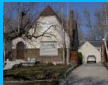
1361 E 1300 SOUTH B