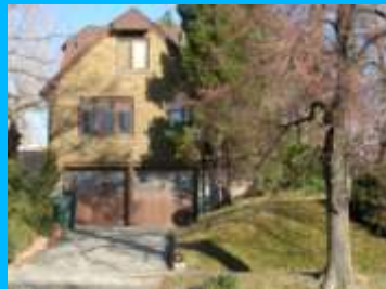
1403 E 900 SOUTH A