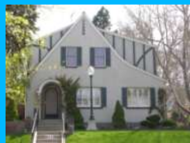
977 S 1700 EAST C