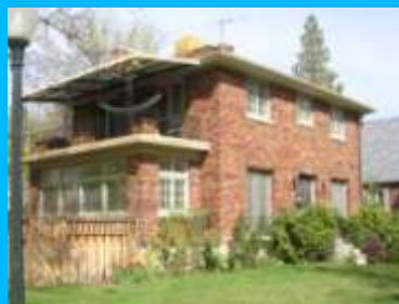
1108 S 1700 EAST A