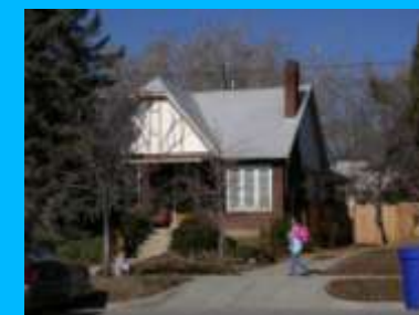
1387 E 1300 SOUTH A