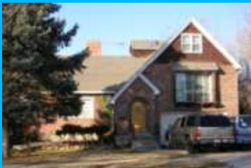
1661 E 1300 SOUTH B