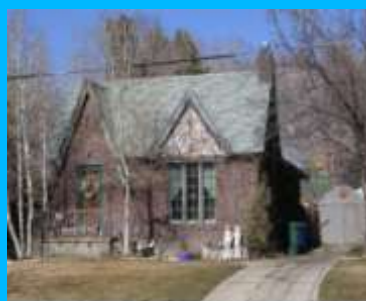
1397 E 1300 SOUTH A