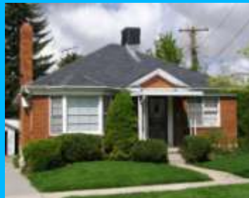
1106 S 1900 EAST B