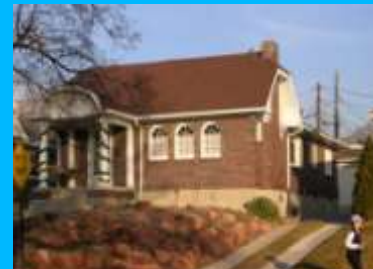
1179 S 1500 EAST A