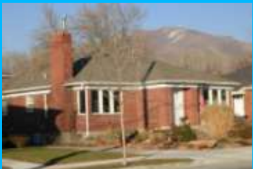
1837 E 1300 SOUTH B