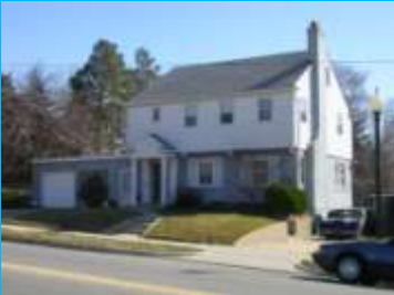
1354 E 900 SOUTH B