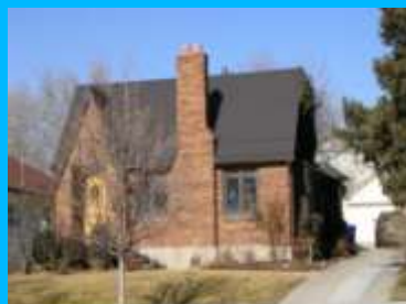
1421 E 1300 SOUTH A