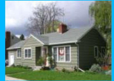
906 S 1900 EAST A