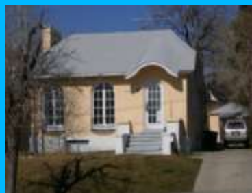
1465 E 1300 SOUTH A