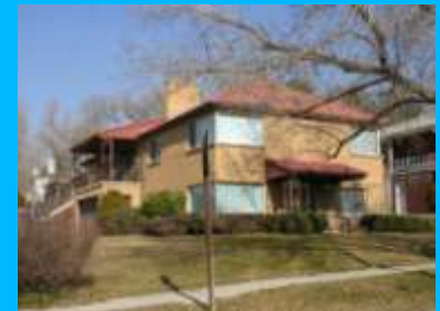
1147 S 1300 EAST B