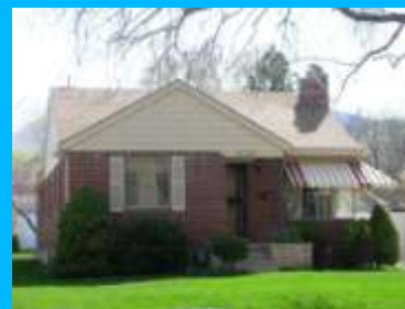
1117 S 1800 EAST A