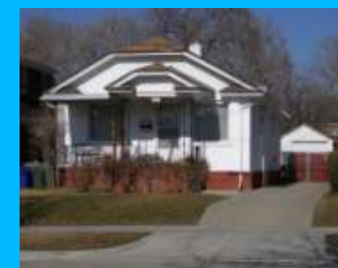
1413 E 1300 SOUTH B