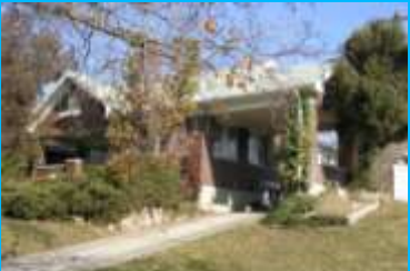
1047 S 1300 EAST A