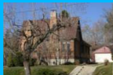
1447 E 1300 SOUTH A