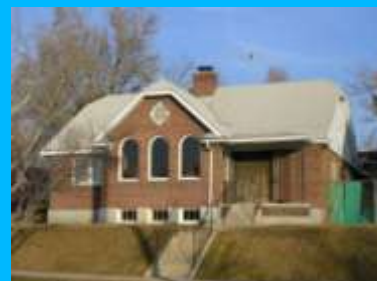
1201 S 1500 EAST B