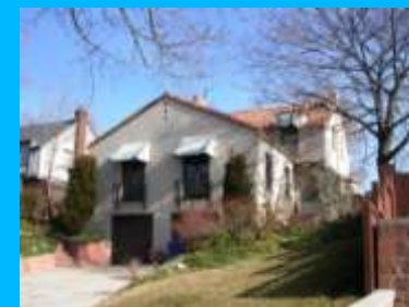
1227 S 1300 EAST A