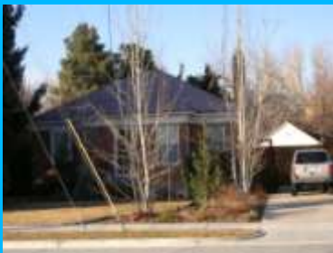
1865 E 1300 SOUTH B