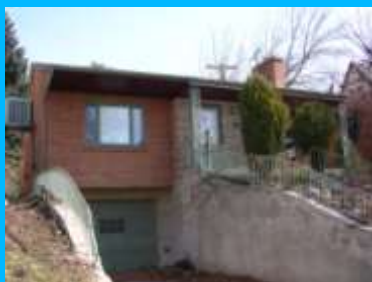
1185 S 1300 EAST A