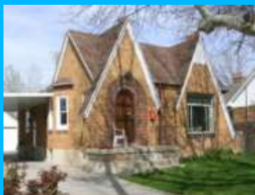
1170 S 1700 EAST A