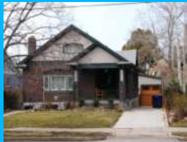
1184 S 1500 EAST A