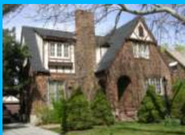
1140 S 1700 EAST B