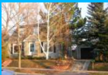
915 S 1500 EAST A