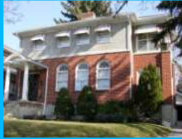
1021 S 1300 EAST B