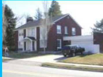
1370 E 900 SOUTH A