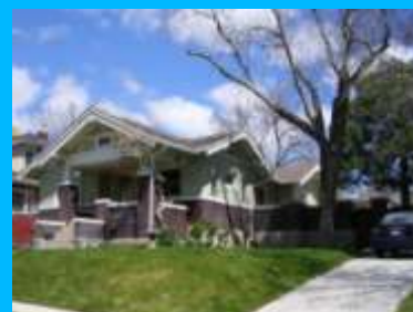
1031 S 1400 EAST A