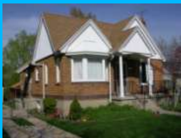
987 S 1700 EAST A