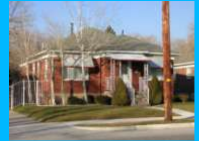
1833 E 1300 SOUTH B