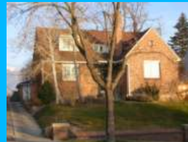
1005 S 1500 EAST B