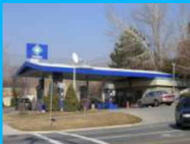
877 S 1300 EAST D