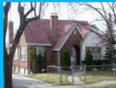
868 S 1400 EAST B