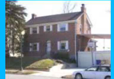
1398 E 900 SOUTH B