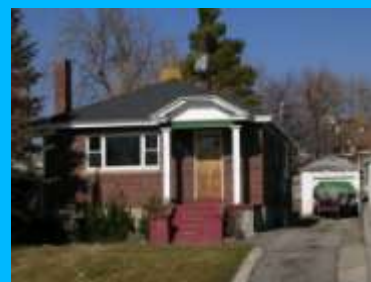
1467 E 1300 SOUTH B