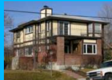
996 S 1500 EAST C