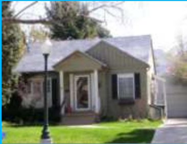
1149 S 1800 EAST A