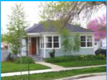
1234 S 1900 EAST B