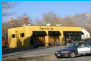
1675 E 1300 SOUTH B