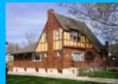
1042 S 1700 EAST C