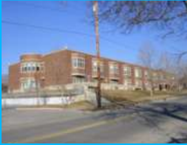
1571 E 1300 SOUTH D