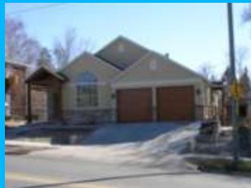
1330 E 900 SOUTH D