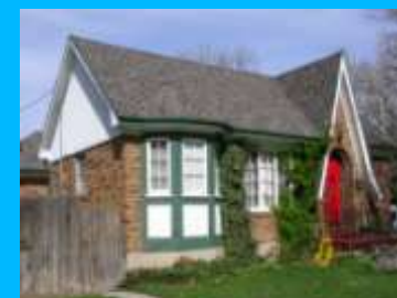
1160 S 1700 EAST A