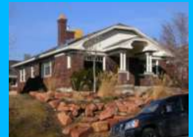
1010 S 1500 EAST A