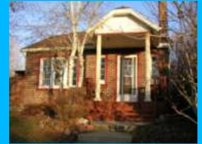
965 S 1500 EAST B