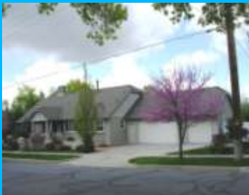
1028 S 1900 EAST B