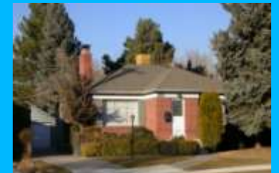
1857 E 1300 SOUTH A