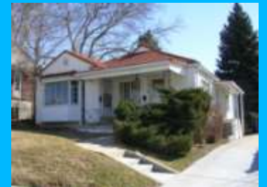
1310 E 900 SOUTH B