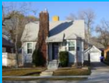
1743 E 1300 SOUTH B