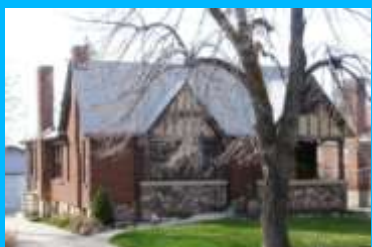
874 S 1400 EAST A