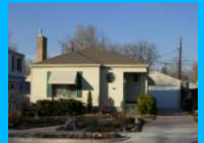
1773 E 1300 SOUTH B