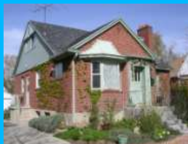
1208 S 1700 EAST B