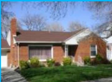
1212 S 1800 EAST A