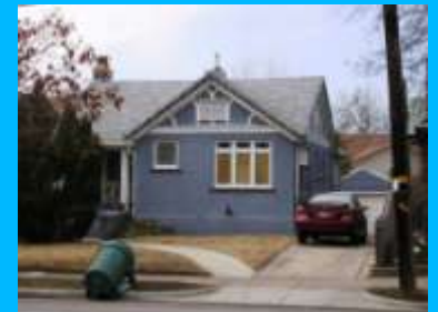
1188 S 1500 EAST A