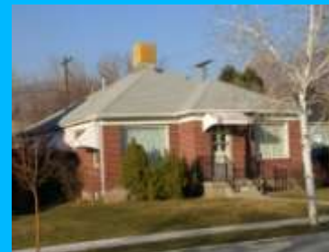
1877 E 1300 SOUTH A