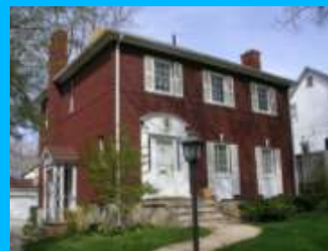
996 S 1700 EAST A