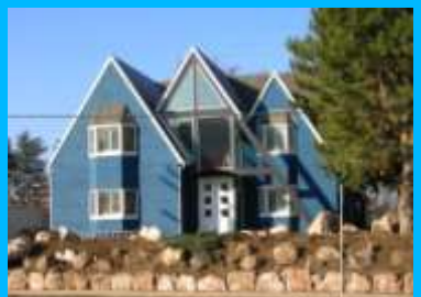
1080 S 1500 EAST C