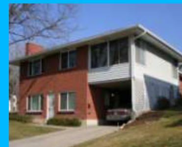
1001 S 1300 EAST D