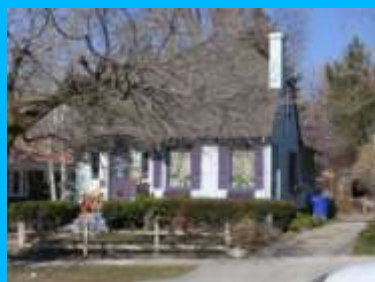
1335 E 1300 SOUTH B