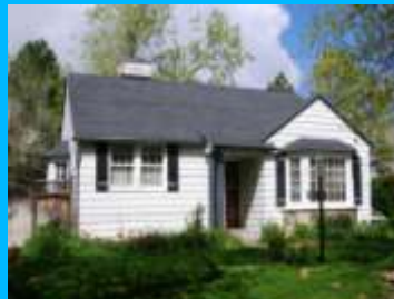
924 S 1900 EAST A