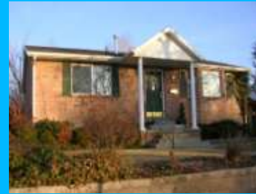
957 S 1500 EAST D