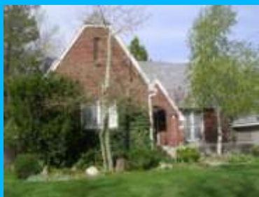
1102 S 1700 EAST A