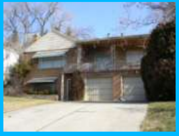
1131 S 1300 EAST B