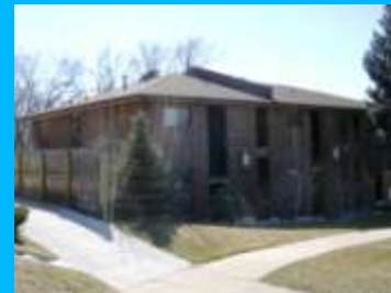
1304 E 900 SOUTH D