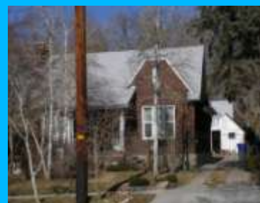
1381 E 1300 SOUTH A