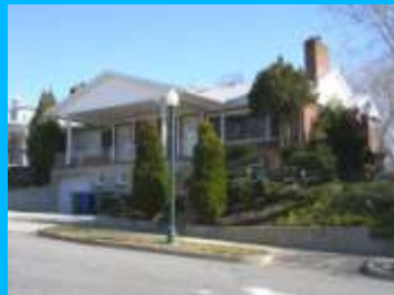
1420 E 900 SOUTH B