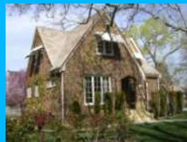
1134 S 1700 EAST A