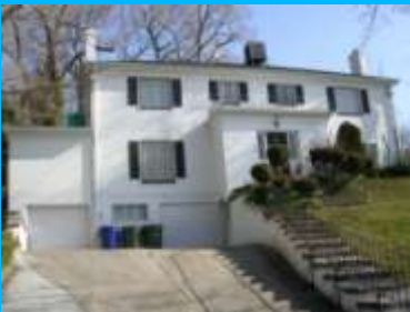
1121 S 1300 EAST A