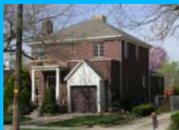
1262 S 1700 EAST A