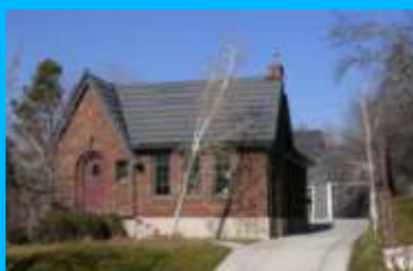
1435 E 1300 SOUTH B