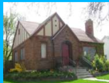
1209 S 1700 EAST A