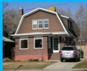
1409 E 1300 SOUTH B