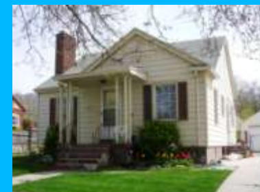
1215 S 1700 EAST B