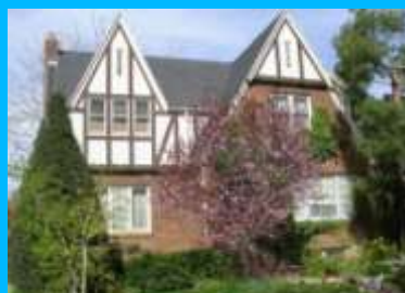
1144 S 1700 EAST A