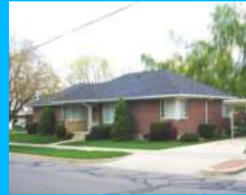
1196 S 1900 EAST A