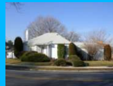
910 S 1500 EAST B