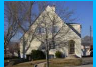
1427 E 900 SOUTH A