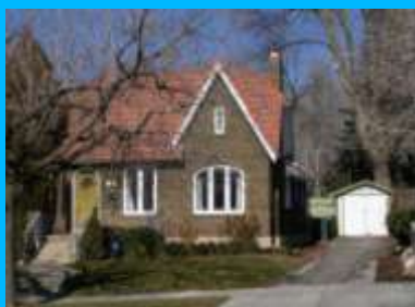
1329 E 1300 SOUTH A