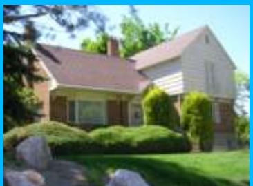
1066 S 1500 EAST A