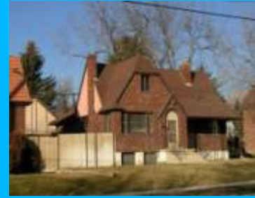
1623 E 1300 SOUTH A