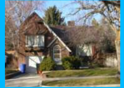
1633 E 1300 SOUTH