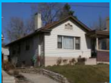
1463 E 1300 SOUTH B