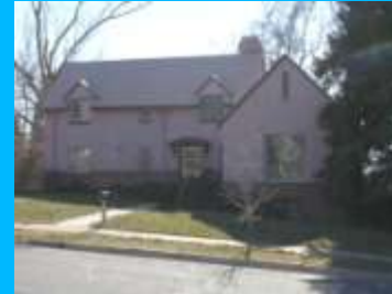
1382 E 900 SOUTH A