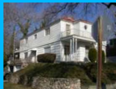
945 S 1300 EAST B