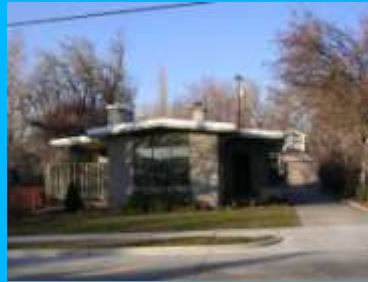
1819 E 1300 SOUTH A