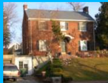
1017 S 1500 EAST A