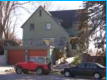
1400 E 900 SOUTH A