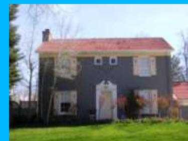
1133 S 1400 EAST A