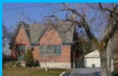
1437 E 1300 SOUTH A