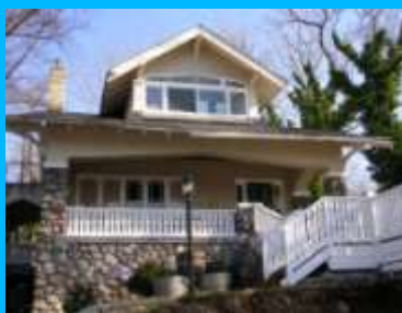
941 S 1300 EAST A