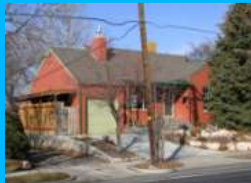
982 S 1500 EAST B