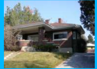
1039 S 1300 EAST A