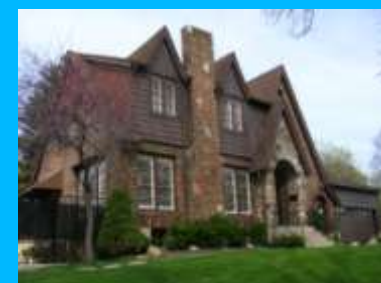
986 S 1700 EAST A