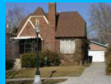
1345 E 1300 SOUTH A