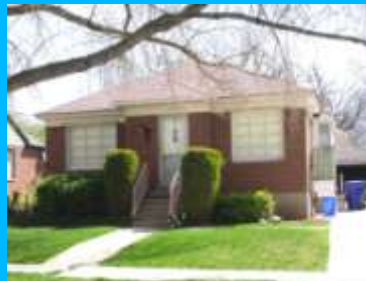
1231 S 1800 EAST A