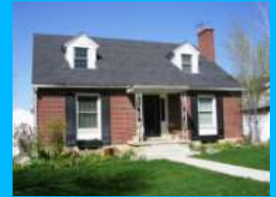
1204 S 1800 EAST A