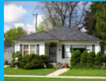
950 S 1900 EAST B