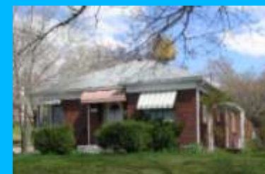
1003 S 1400 EAST A