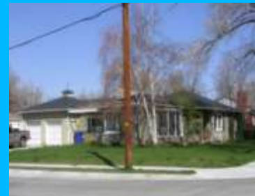
1234 S 18 EAST B