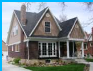
1058 S 1700 EAST C