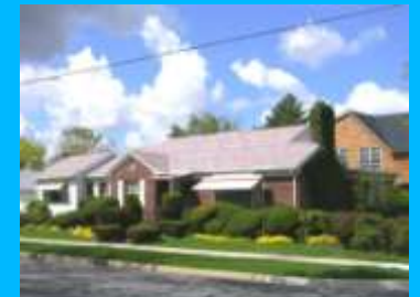
1008 S 1900 EAST C