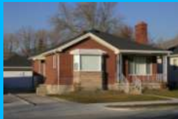
1843 E 1300 SOUTH B