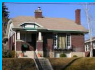
1016 S 1500 EAST A