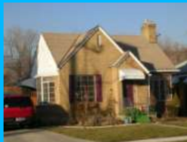
1871 E 1300 SOUTH A