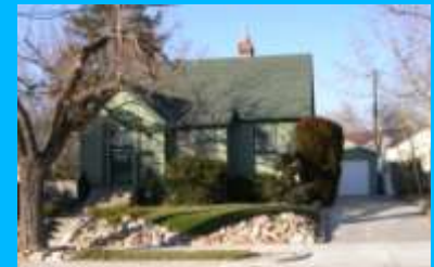
1719 E 1300 SOUTH A