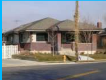
948 S 1500 EAST A