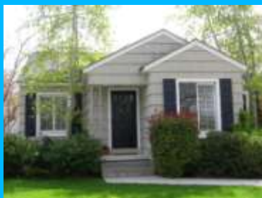
1205 S 1700 EAST A