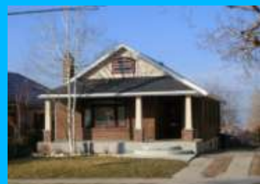
1232 S 1500 EAST C