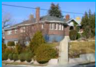
1024 S 1500 EAST B