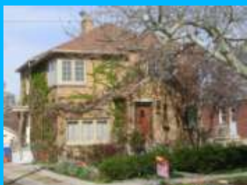
1256 S 1700 EAST B