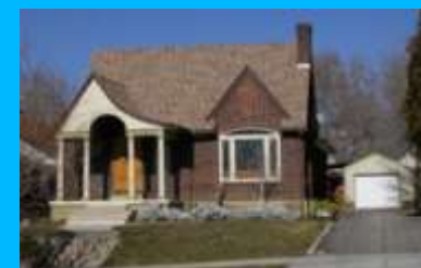
1325 E 1300 SOUTH A