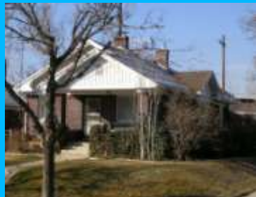
1004 S 1500 EAST B