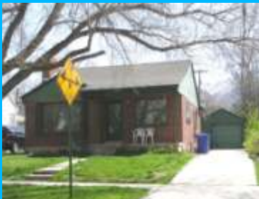
1223 S 1800 EAST A