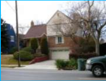
1136 S 1500 EAST A