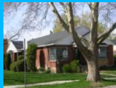
1194 S 1700 EAST A