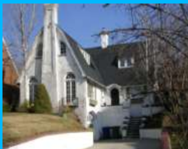
979 S 1300 EAST A