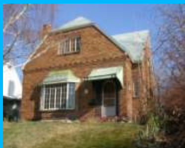
975 S 1300 EAST A