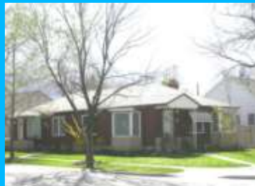
1213 S 1800 EAST B