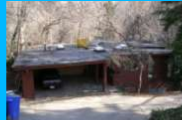
1087 S 1300 EAST D