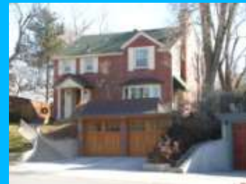
1404 E 900 SOUTH A