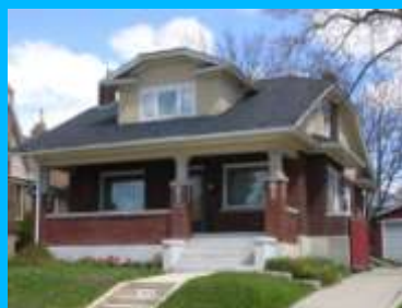
1015 S 1400 EAST B