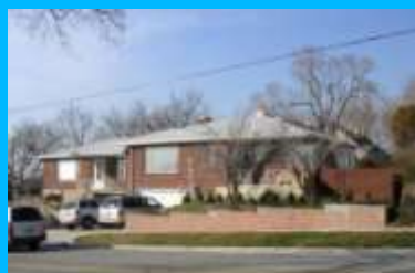
1305 E 1300 SOUTH A