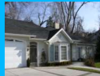
925 S 1300 EAST C