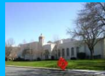
1035 S 1800 EAST A