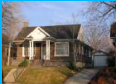
1175 S 1500 EAST A