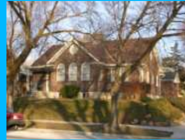
1149 S 1500 EAST A