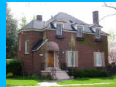
1135 S 1700 EAST A