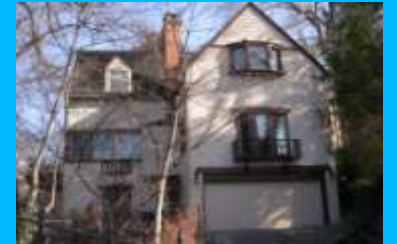
1111 S 1300 EAST A