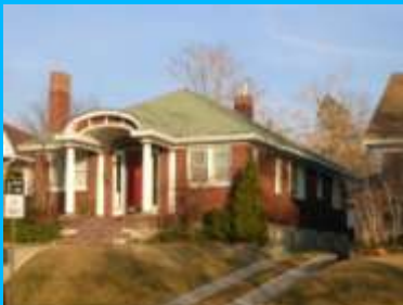
1183 S 1500 EAST A