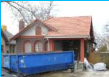
1174 S 1500 EAST B