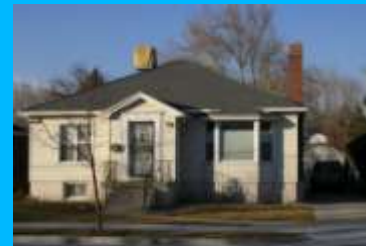
1849 E 1300 SOUTH B