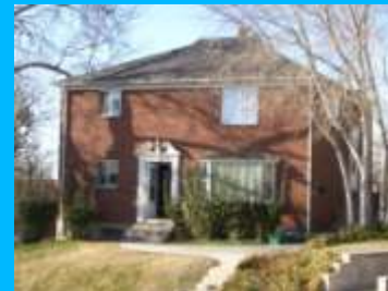
1421 E 900 SOUTH B