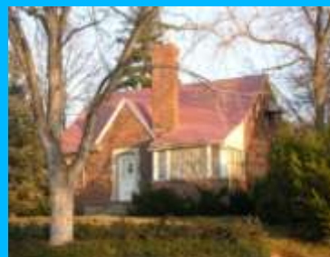
909 S 1500 EAST A