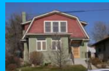
1457 E 1300 SOUTH B