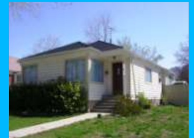
1235 S 1800 EAST B