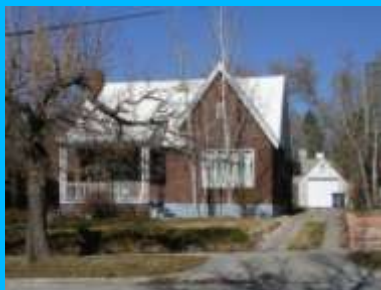
1349 E 1300 SOUTH B