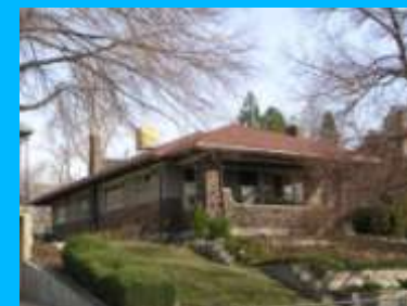
871 S 1400 EAST A