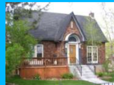
1024 S 1700 EAST A