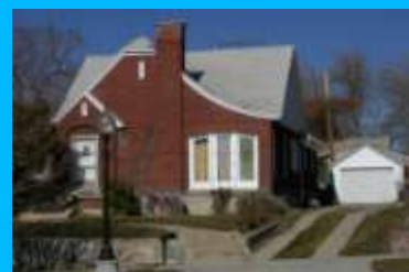
1319 E 1300 SOUTH A