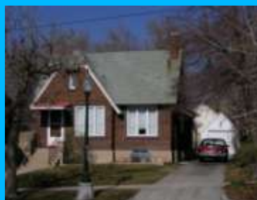
1375 E 1300 SOUTH A