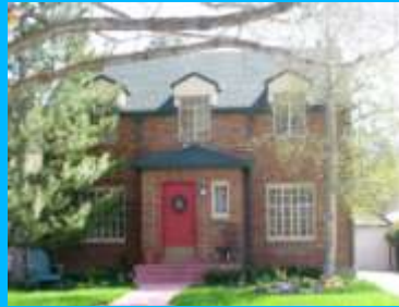
1157 S 1800 EAST A