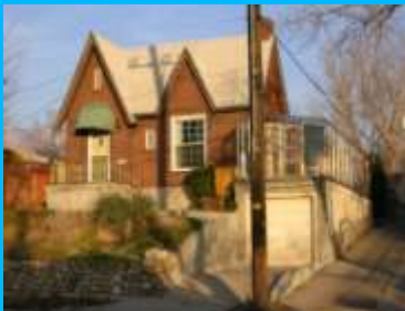
999 S 1500 EAST B