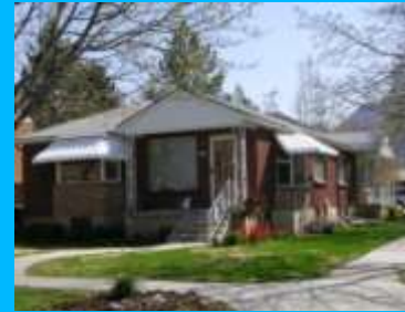
1161 S 1800 EAST A