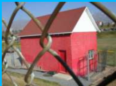
851? 1300 EAST D