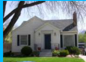
1219 S 1800 EAST A