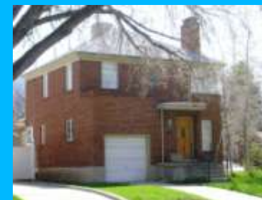
1121 S 1800 EAST A