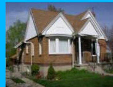
1202 S 1700 EAST A