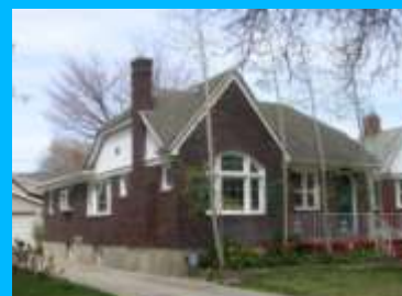
1036 S 1700 EAST A