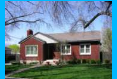
1222 S 1800 EAST B