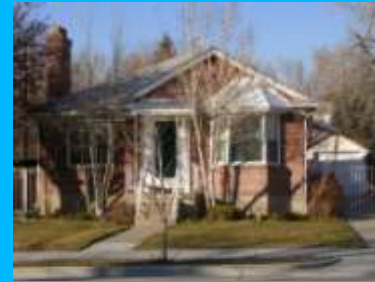
1825 E 1300 SOUTH B