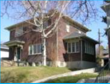
1013 S 1300 EAST A