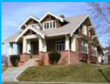
851 S 1400 EAST A