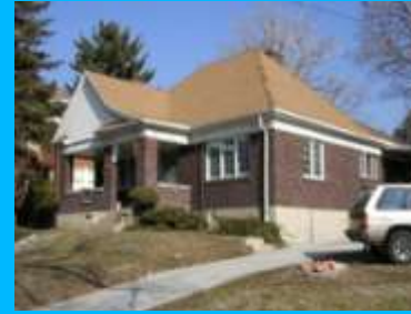
1027 S 1300 EAST B