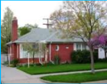
1152 S 1900 EAST A