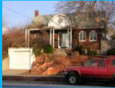
1145 S 1500 EAST B