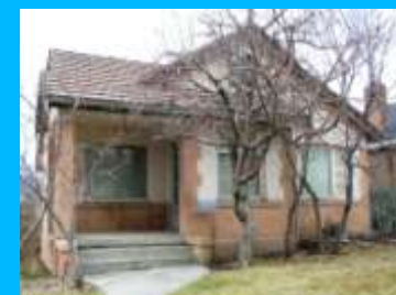
1238 S 1500 EAST B