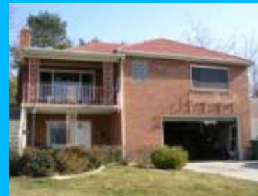
1137 S 1300 EAST B