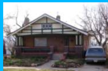
882 S 1400 EAST A