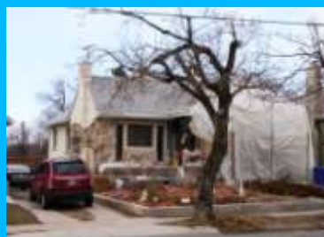
1224 S 1500 EAST C