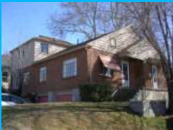
1326 E 900 SOUTH A