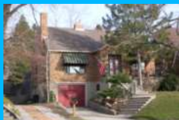
875 S 1400 EAST B