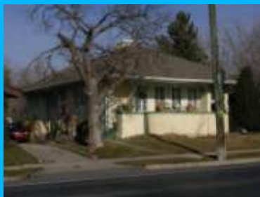
932 S 1500 EAST B