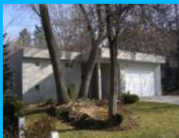
933 S 1300 EAST D