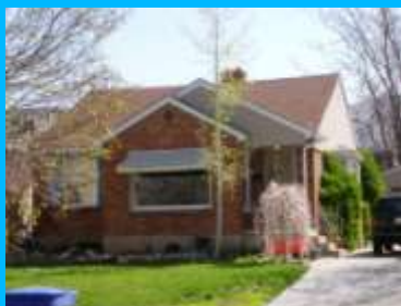
1105 S 1800 EAST A