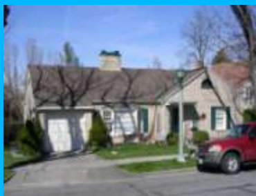
1150 S 1400 EAST A