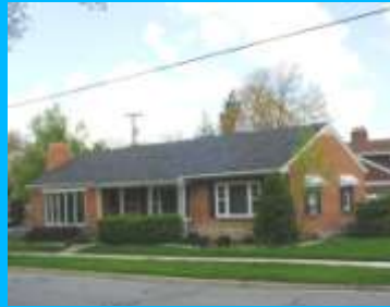
1180 S 1900 EAST D