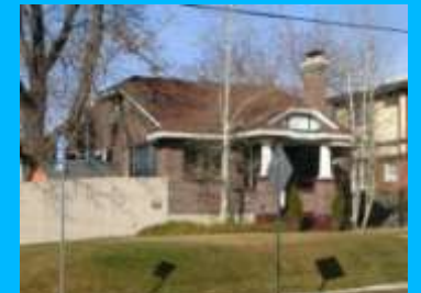
998 S 1500 EAST A